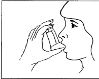
Closed Mouth Between Teeth if HFA